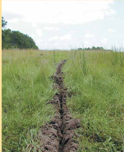
A Rip

Although containerized seedlings are more expensive than bare-root seedlings, survival and growth rates are generally better. Uniform seedling size makes handling and planting much easier. It is important to use healthy, freshly lifted seedlings. Planting depth is not as critical as with bare-root seedlings, as long as the containerized seedlings are not planted too deep. Recent studies conducted by the Longleaf Alliance have found that it is acceptable for an inch or so of the root plug to be above the surface of the ground.