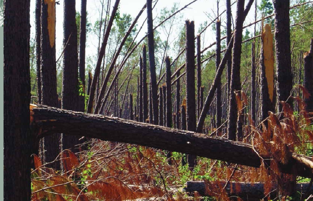
Damaged Loblolly Stand

The pre-Katrina stocking density (249 trees / acre) and BA(111ft 2 / acre) of the slash stands averaged only slightly less than that of the loblolly stands. Product classes consisted primarily of chip-n-saw, pulpwood and a minor amount of sawtimber. Slash fared far better than loblolly across both sites (Table 9). A little more than 52 percent of the slash surveyed was undamaged. However, as with loblolly the majority of the damage consisted of snapped trees. With more than 38 percent of the damage