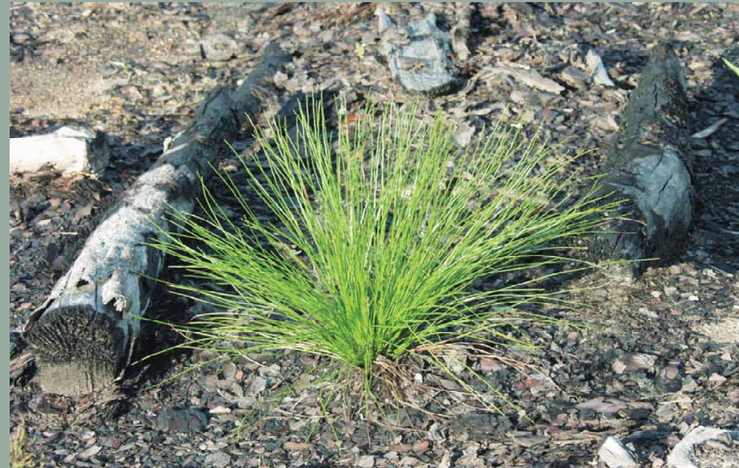
Grass-stage Seedling

Although longleaf are fire resistant, they are not fireproof. Seedlings less than 3 feet tall and in the "candelabra" stage are susceptible to fire damage. During this stage, the bark is thin and the terminal bud is within flame height and exposed to normal surface fires. Once the seedling reaches a height of 6 feet, it becomes fire resistant again.