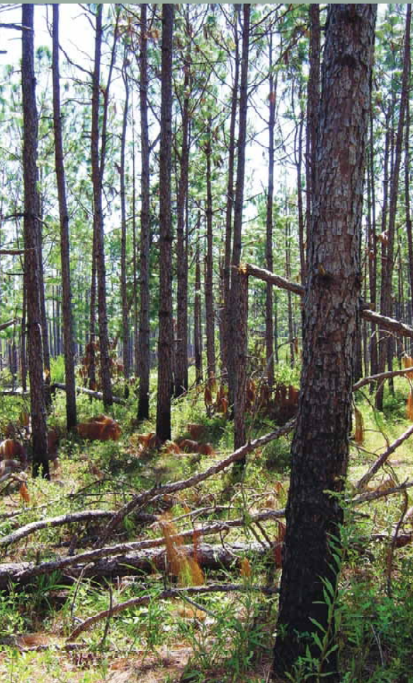
Damaged Longleaf