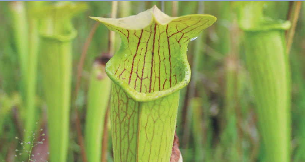
Yellow Pitcher Plant

Savannas, because of a high water table, are typically the wettest of the longleaf communities. Savannas are open with little overstory. Understory plant communities are very diverse and may contain wiregrass, sedges, orchids, American chaffseed and rough-leaved loosestrife. Insectivorous plants that may be found include pitcher plants, bladderworts, venus flytrap and sundews. Rare, threatened or endangered birds that may occur in these areas include Henslow's sparrow, Bachman's sparrow, red-cockaded woodpecker and Mississippi sandhill crane.