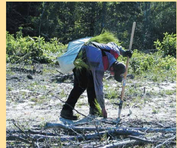
Planting Seedlings