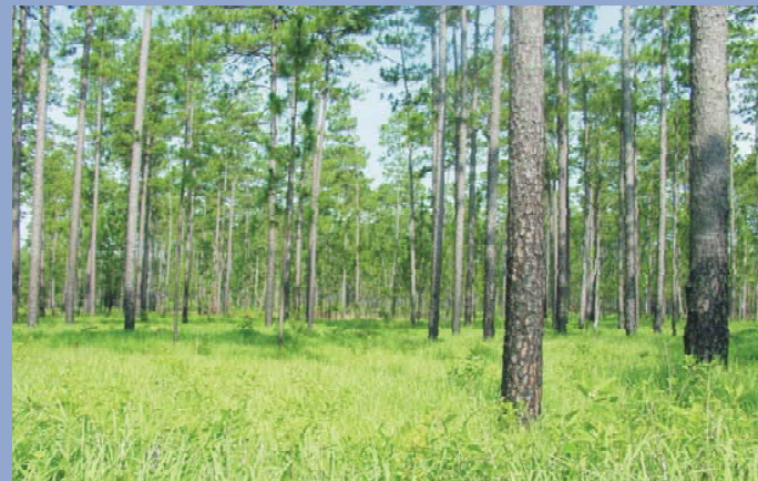
Cogongrass Under Pines