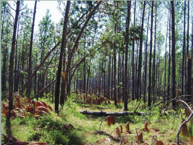
Damaged Slash Stand (left), Damaged Longleaf Stand (right).

force winds than loblolly and slash. Landowners along the Southern Coastal Plain are at risk of future hurricanes. Replanting with longleaf is a way to reduce the risk associated with such catastrophic events.