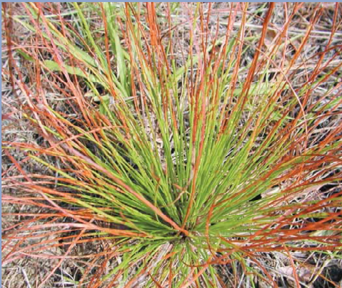
Brown-spot Needle Blight

Pathogens that affect all Southern pines include annosus root rot, fusiform rust and pitch canker. Although longleaf can be infected with these pathogens, they are less susceptible to these diseases than loblolly or slash. However, brown-spot needle blight is a serious disease of longleaf and can suppress growth and eventually kill grass-stage seedlings. Brown-spot is a fungal infestation that causes needle loss in grass-stage seedlings, but is not a significant