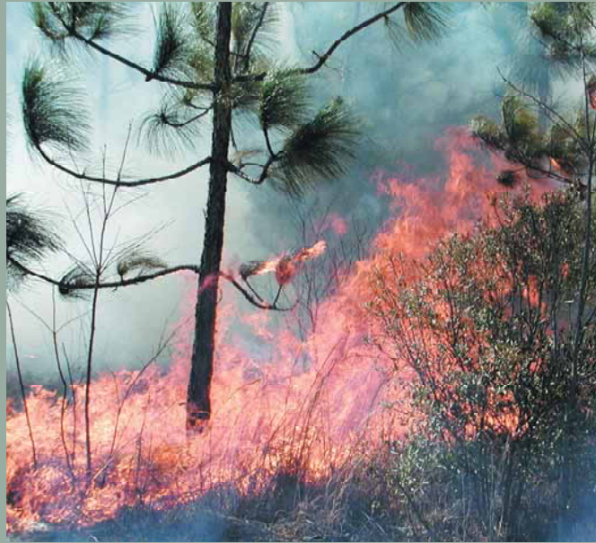
Prescribed Burning

Considering these challenges, and depending on the goals of the landowner, longleaf can be considered on all but the wettest sites within its normal range. Success can only be measured in terms of the landowner's objectives.