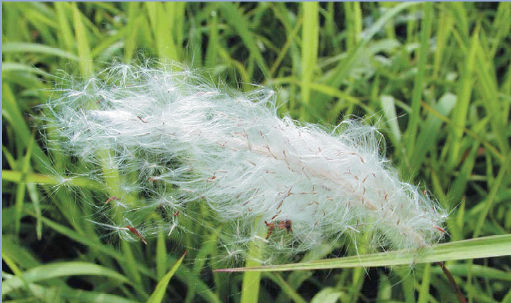
Cogongrass Bloom

Although cogongrass has a relatively high rate of natural spread, mechanical spread is accelerating the problem. Landowners and contractors spread cogongrass across the landscape by moving contaminated soil and equipment while conducting normal management practices such as timber harvest and the construction and maintenance of food plots, roads and fire lanes.