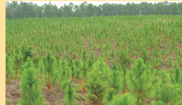
Artificially Regenerated Longleaf

Great strides in knowledge have been made in recent years regarding artificial regeneration of longleaf pine. Planting failures can be minimized, if not eliminated, by using proven techniques. Adequate site preparation, good quality seedlings, proper handling of seedlings and proper planting depth are all critical factors.