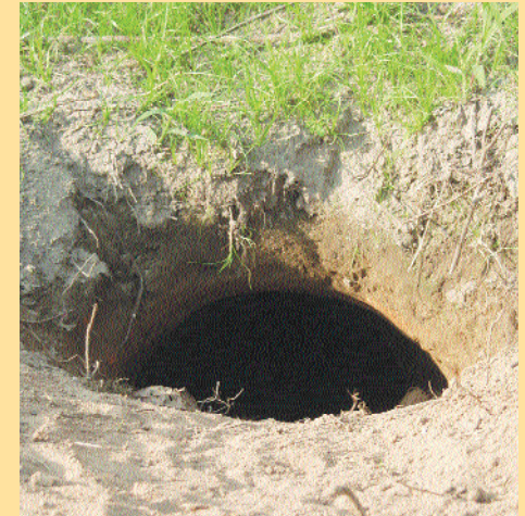
Gopher Tortoise Burrow

The Eastern indigo snake is federally listed as threatened because of the overall decline in the species. This decline has been attributed to the destruction of suitable habitat, which is primarily the longleaf ecosystem.