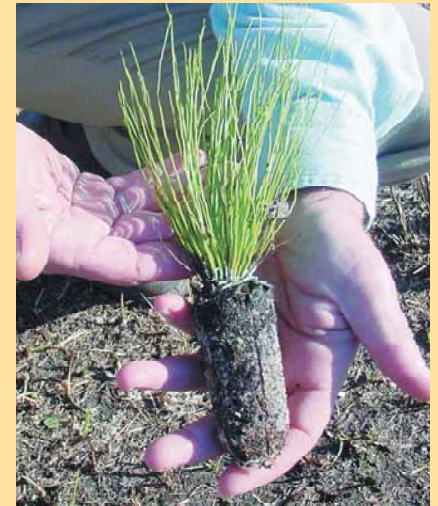
A Containerized Seedling

Spacing and planting densities vary with the goals of the landowner. Seedling densities can range from 400 to 700 seedlings per acre. If low survival is anticipated, as during years of severe drought, more seedlings may be planted to offset mortality. Lower densities may be desirable where a more open condition is wanted. This might be desirable