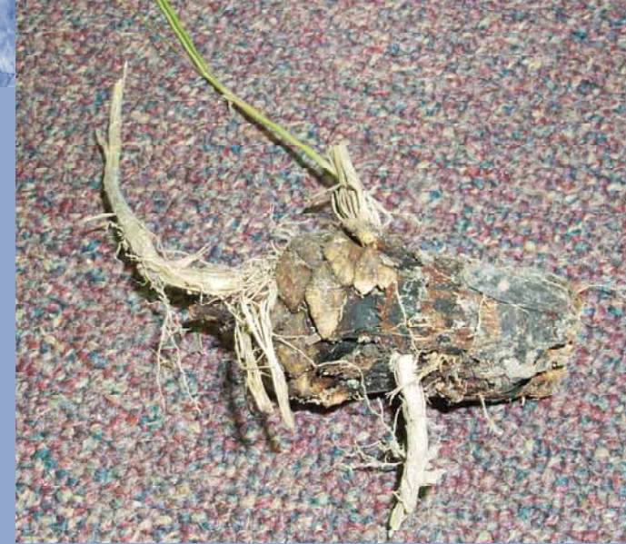
Cogongrass Root Through Pine Cone

Infestations from this alien plant can have serious implications for resource management. Dense stands of this grass can cause significant stress on forested stands by competing for available moisture and nutrients and by literally growing through the roots of native trees. Cogongrass is also allelopathic, meaning it produces its own chemical enzymes that prohibit the growth of other vegetation. Dense stands also create physical barriers that keep native plant seeds from reaching mineral soil. Cogongrass also burns at extremely high temperatures (842°F) and dense stands can cause significant loss of forest products from either prescribed burns or from wild fires.