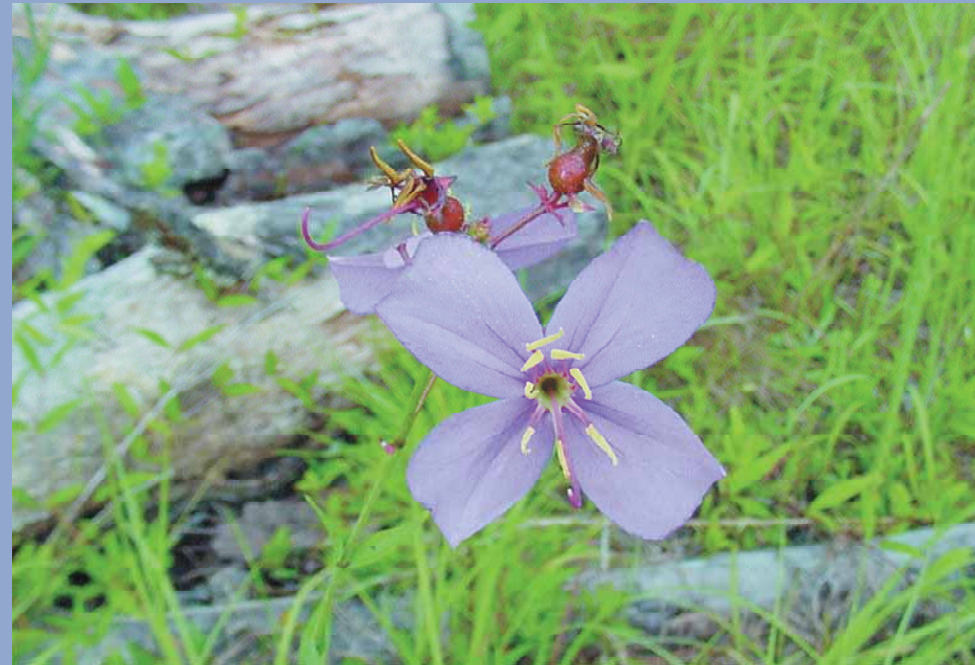
Meadow Beauty

Rolling mesic hills are among the most productive longleaf sites. Often with a sandy surface, they have fine textured soils with higher clay contents and are very diverse. Loblolly and shortleaf pine along with numerous species of hardwoods occur in association with this community. Species of hardwoods include gallberry, yaupon, wax myrtle, blueberry, huckleberry, sweetgum, blackgum, Southern red oak, post oak, live oak, white oak, chinkapin, dogwood, black cherry and hickories. Understory vegetation includes Indian grasses, three-awn grasses, bluestem grasses, meadow beauties and dropseeds. Wildlife that may be found in rolling mesic hills include white-tailed deer, black bear, wild turkey, bobwhite quail, fox squirrel, cottontail rabbits, gopher tortoise, Eastern diamondback rattlesnake, Louisiana and black pine snakes, red-cockaded woodpecker, Bachman's sparrow, great crested fly catcher, indigo bunting and summer tanager.