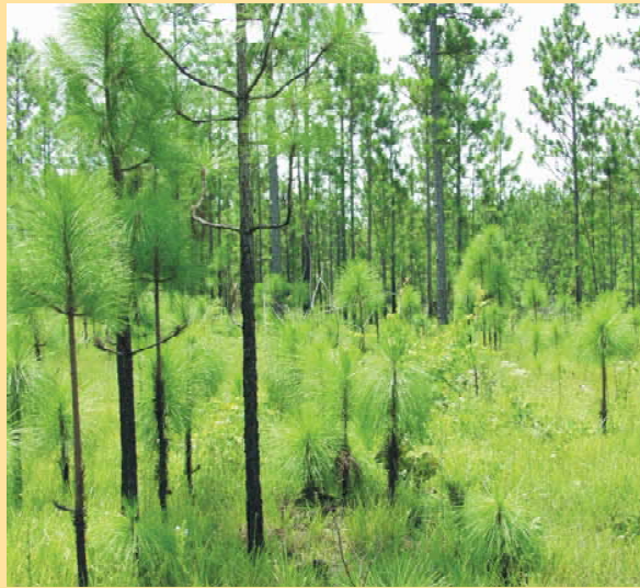
Uneven-aged Longleaf Stand

A stand with three or more distinct age (or diameter) classes is said to be uneven-aged. Maintaining a healthy forest in an uneven-aged condition requires different techniques than even-aged management systems. Uneven-aged management systems, as with other management systems, have inherent advantages and disadvantages (see Table 2).